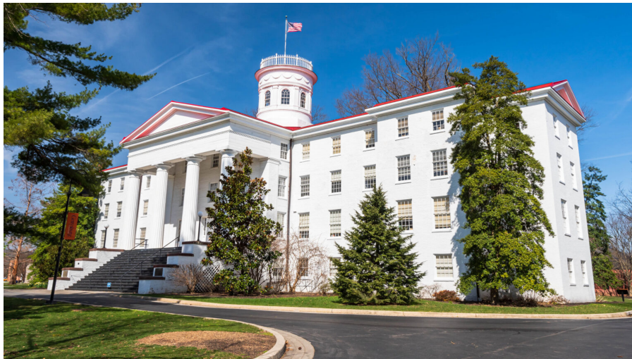
The campus at Gettysburg College.

An organization representing Pennsylvania's 85 independent colleges and universities is warning the commonwealth's congressional delegation that cuts to federal research funding could damage the state's economy, reduce the number of students who come here for higher education and set back American science, among other consequences.